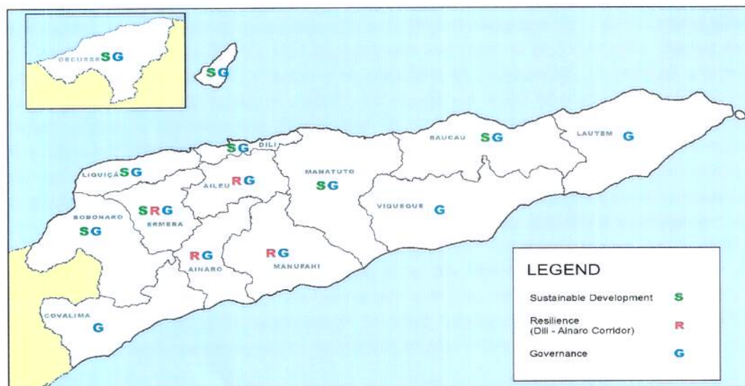
Figure IV.2: Location of proposed Programme intervention